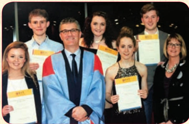
■ Bronnadh scoláireachtaí chuig UCC ar dhaltáí na hArdteiste 2016.

The aims of the Curriculum are to encourage independent thinking amongst students, to inspire and motivate students to learn. Thanks to the work and dedication of both students and teachers, excellent academic results are achieved and a large percentage of students continue on to Third Level Education. In the most recent statistics, the school has a transfer ratio of 95% to third level. Gaelcholáiste Choilm is a top feeder school to UCC and to CIT.