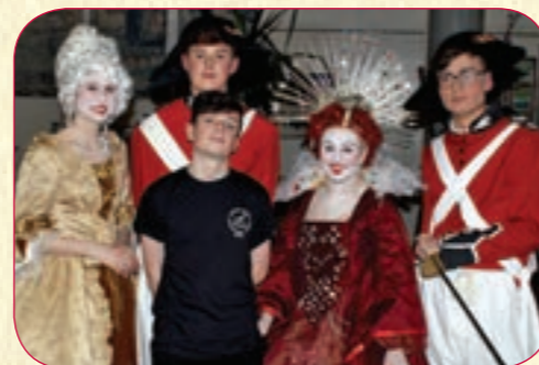
■ Scoláirí TY ag glacadh páirte i seo-dhráma na scoile 2016-2017 "The Pirate Queen".

Transition Year is optional and is availed of by upwards of 95% of pupils. It offers a broad educational experience with a view to the attainment of increased maturity before proceeding to further study.