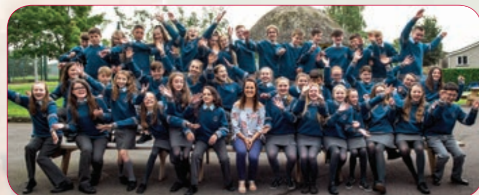
■ Fearaimid fáilte is fiche roimh an gCéad Bhliain a thosaigh i mbliana.