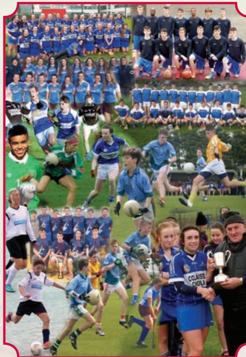
■ SPORTING SUCCESSES OF COLÁISTE / GAECHOLÁISTE CHOILM