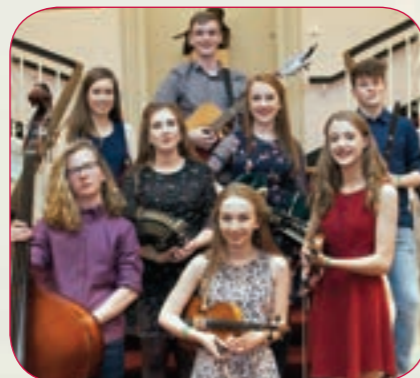
■ Grúpa trad "Leoithne" ar stáitse an Cheolárais Náisiúnta.