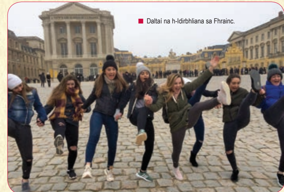
■ Daltáí na h-Idirbhliana sa Fhrainc.

The school website provides up-to-date information. The Parent Association is also a very valuable means of communication between school and home.